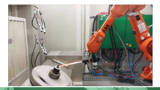
Thermal Spray: HVOF, plasma, twin arc, ...

3D processes Flexible (size, coatings) Up-scalable process Data monitoring for LCA